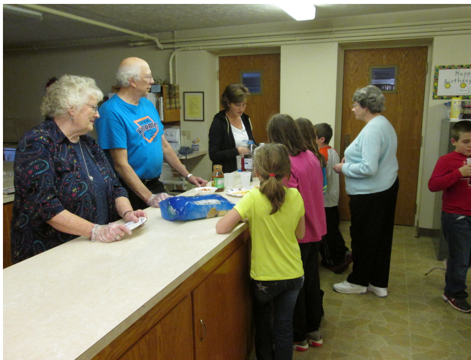
Snack time is a favorite of the Bethel Homework Help students.

May God use us profoundly as we serve these children and their families this school year!