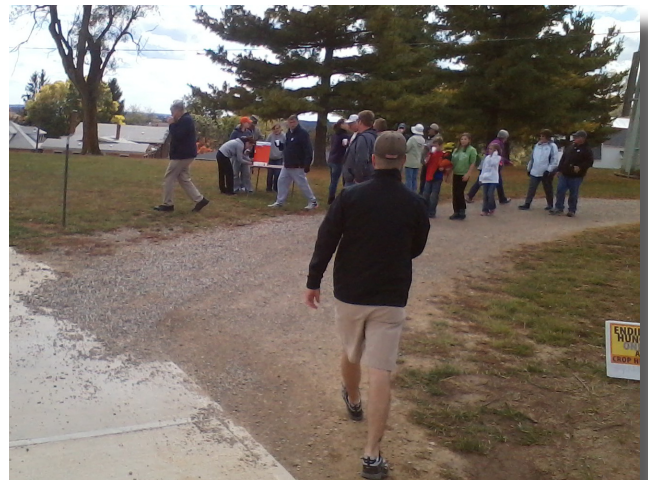
Bethelites and other participants enjoy the CROP Walk

We are grateful to all who supported the walk this year, both in participation and sponsorship and are pleased to report that we raised a total of $1300.00 for the cause!