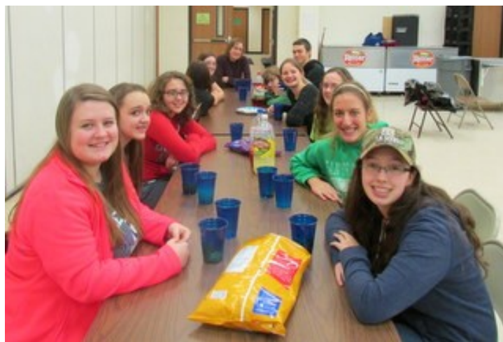
Bethel Youth and Central Christian youth fellowship for an evening at Adriel. See more on Page 2.